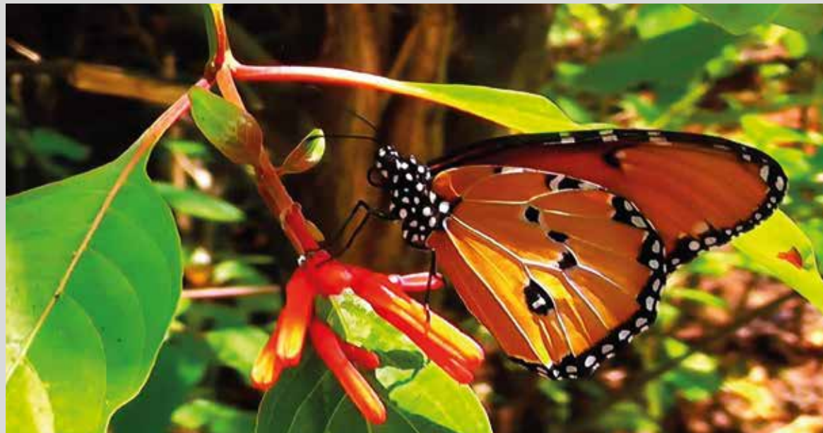
Zanzibar Butterfly Center