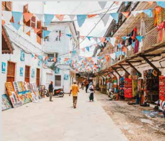
A view of Stone Town - Zanzibar