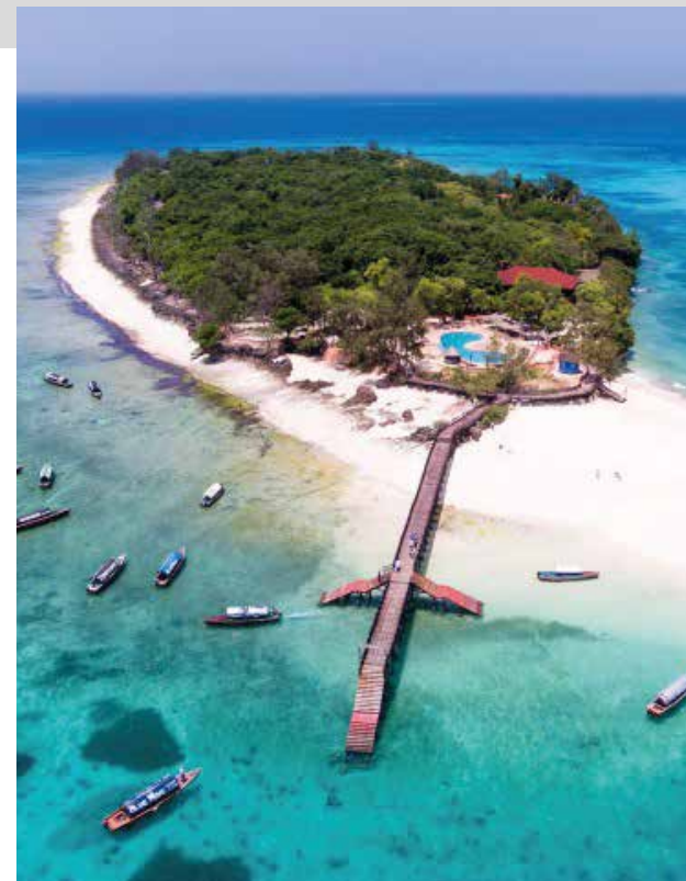
Zanzibar Prison Island